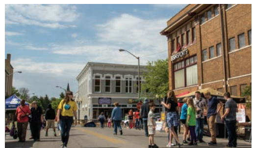
ALL-IN BLOCK PARTY INDIANA UNIVERSITY EAST