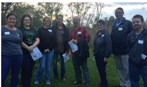
NEXT INDIANA CAMPFIRE COPE ENVIRONMENTAL CENTER

- Muncie Public Library Next Indiana Film Discussion Host