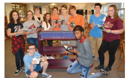
GRANT PROGRAM CHESTERTON MIDDLE SCHOOL