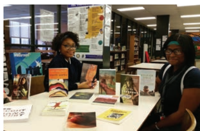
NEXT INDIANA BOOKSHELF MORTON HIGH SCHOOL

Michigan City Public Library Host of Next Indiana Film Discussion