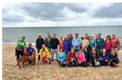
NEXT INDIANA CAMPFIRES INDIANA DUNES